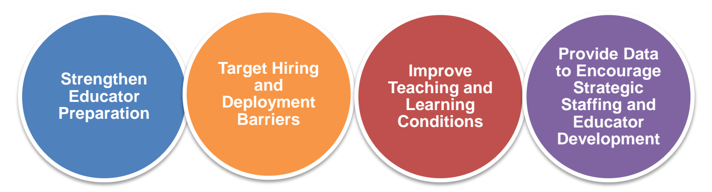
FIGURE 3. FOUR STRATEGIES FOR ELIMINATING IDENTIFIED EDUCATOR EQUITY GAPS

This strategy section of Ohio's Educator Equity Plan is organized around four strategies to eliminate identified educator equity gaps. These four strategies meet one or more of the following criteria: