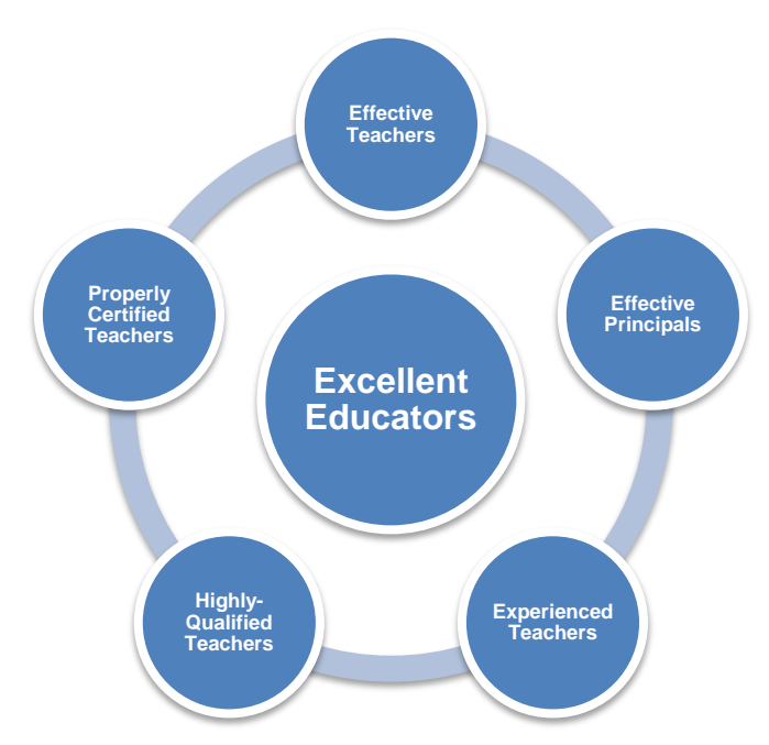
FIGURE 1. FIVE MEASURES FOR OHIO'S EDUCATOR EQUITY PLAN

All students deserve to have excellent educators teaching and leading their schools. This equity plan delineates an excellent educator using the five measures illustrated in Figure 1. As identified in section two, the plan outlines Ohio's educator equity gaps based upon these measures. To address these equity gaps, Ohio must first understand why these gaps exist in our high-poverty and high-minority schools.