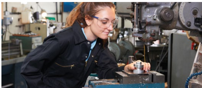
STUDENTS WHO ENJOY turning ideas into reality

Manufacturing careers include creativity, caring, and collaboration, three Cs that have been connected to motivation and engagement for many students, especially women and students of color. 9 What kinds of students would like a career in manufacturing?