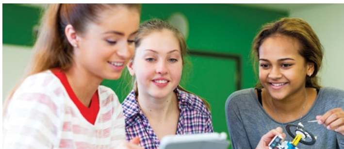
STUDENTS WHO ENJOY problem-solving with a team