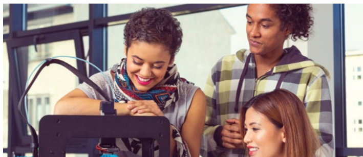
STUDENTS WHO ENJOY working with advanced technologies

Manufacturing is an exciting, creative and high-tech field. Advanced manufacturing technologies will help the United States lead the world in innovation, job growth, and a healthy economy. Every day manufacturers are using new processes and materials to make products safer, less expensive, and easier to use, which is better for all consumers. We can also now manufacture products on-demand to reduce waste, which is better for the environment. Members on a manufacturing team are creative and collaborate to make safe products that simplify tasks or just make life easier.